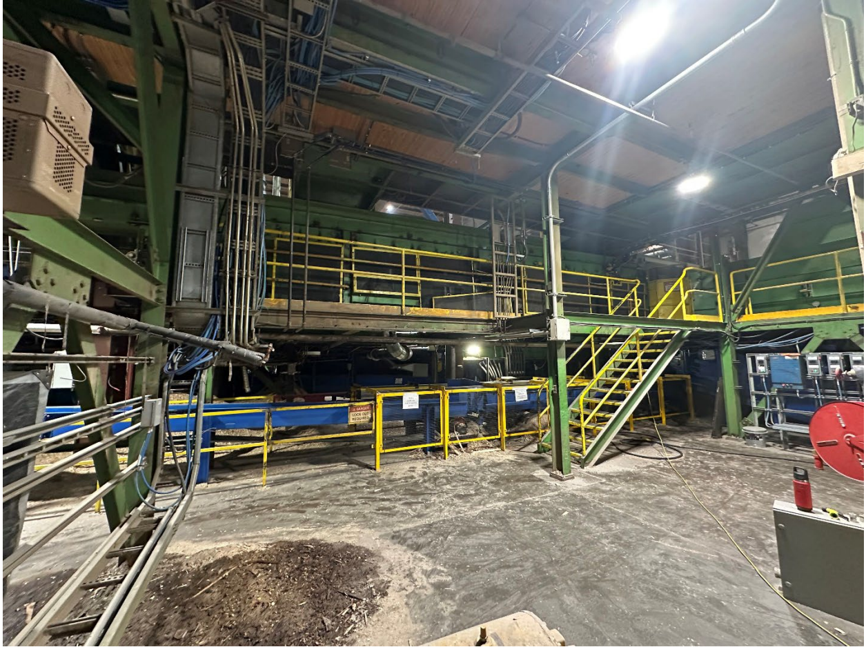
At lower level looking east