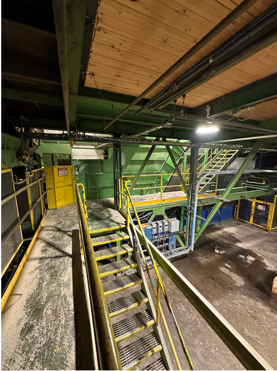
At proposed level looking south