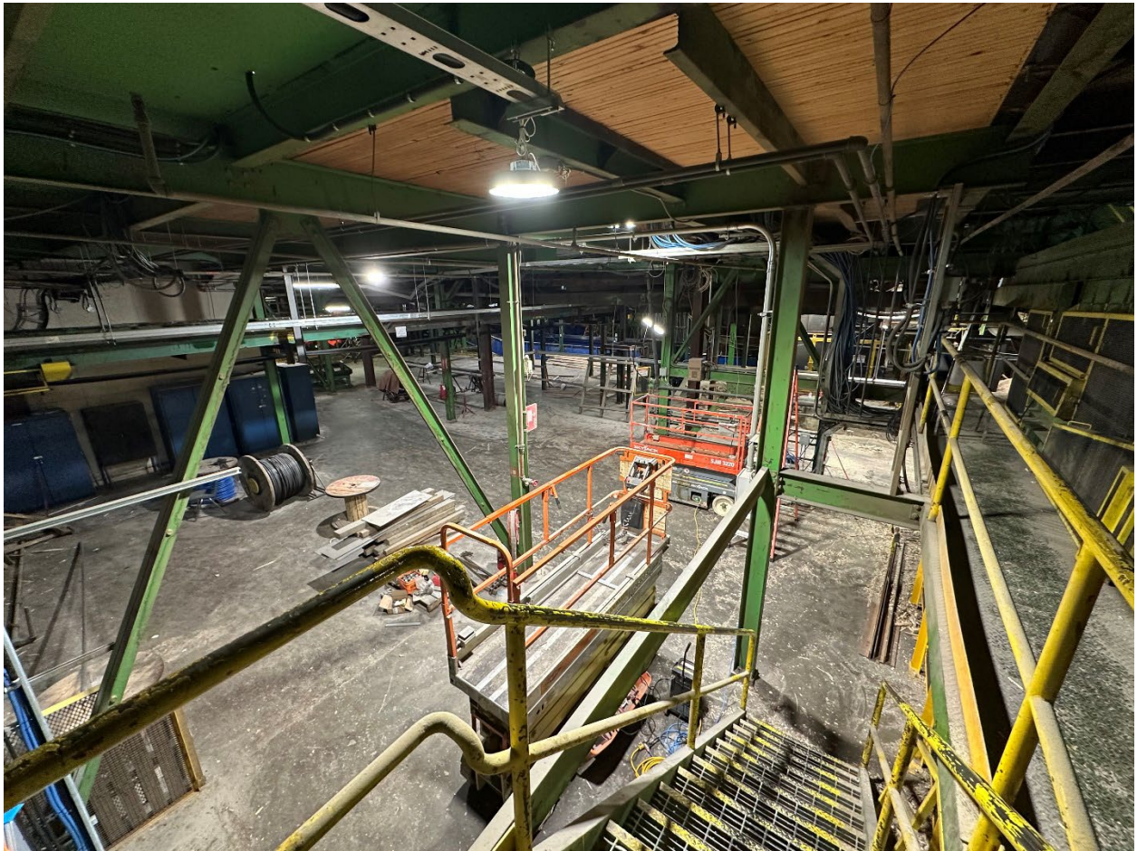
At proposed level looking north