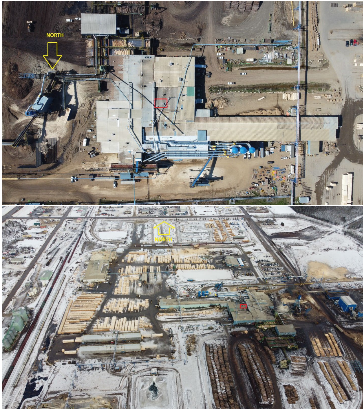
Site photos, red square marks new room