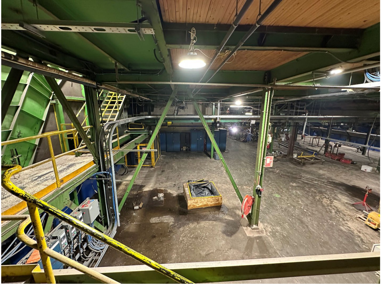
At proposed level looking west