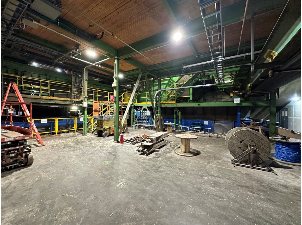
At lower level looking south/east